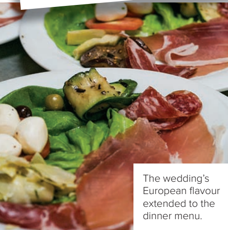
The wedding's European flavour extended to the dinner menu.