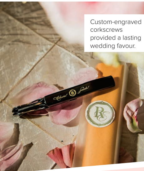
Custom-engraved corkscrews provided a lasting wedding favour.