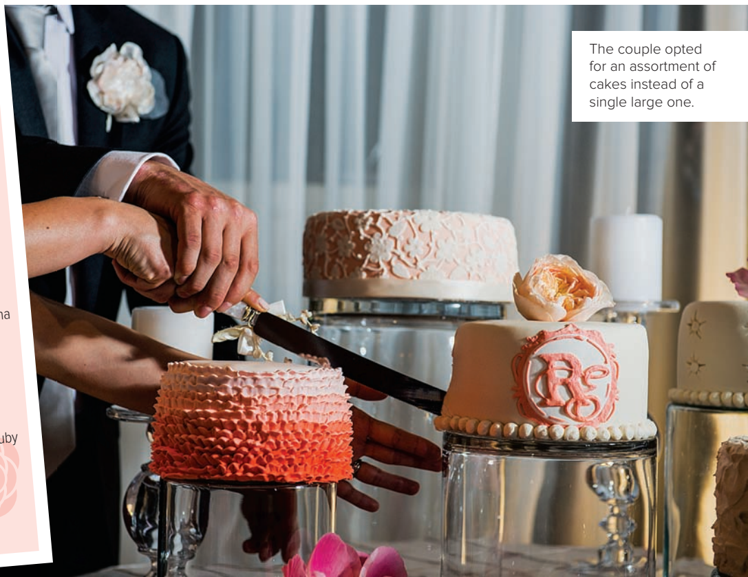
The couple opted for an assortment of cakes instead of a single large one.

Transportation Excel Limousine excellimousine.ca