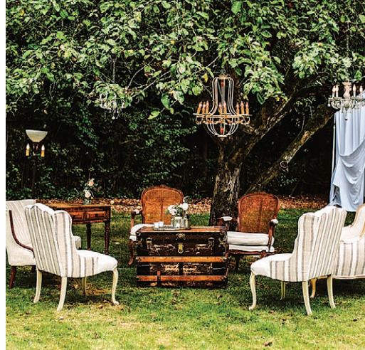
The ceremony took place in the front yard before moving to the back for a tented reception featuring cocktails, tasty West Coast fare and live music. The vintage-rustic theme continued throughout, from the retro-inspired lounge area to the organic styling of the florals and homey touches like chalkboards, mason jars and old-fashioned lanterns.