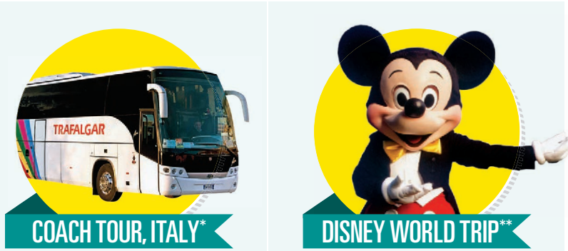
COACH TOUR, ITALY*

Think you can't afford a coach tour in Europe? Well, we compared the cost of taking a family of four to Europe with that of taking the same crew to Disney World – and learned the price gap isn't as big as we thought.