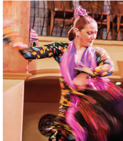
A flamenco dancer performs at El Patio Sevillano, a well-known tablaó , or flamenco theatre, near the Guadalquivir River in Seville.

Insight's tours, with restaurants handpicked by the company's savvy tour directors. On each tour, one night is reserved for what the company calls Dine-Around, when the main group breaks into three, based on a trio of restaurant options selected by the tour director. But all of our meals on this trip have been incredible, from the Lagareiro-style (baked, then grilled), garlic-crusted octopus we had in a tiny, candlelit bistro in Lisbon to the crispy-fried cod and pomegranate salad we ate at rustic Sem-Fim Restaurant in Monsaraz, overlooking pastures and olive groves.