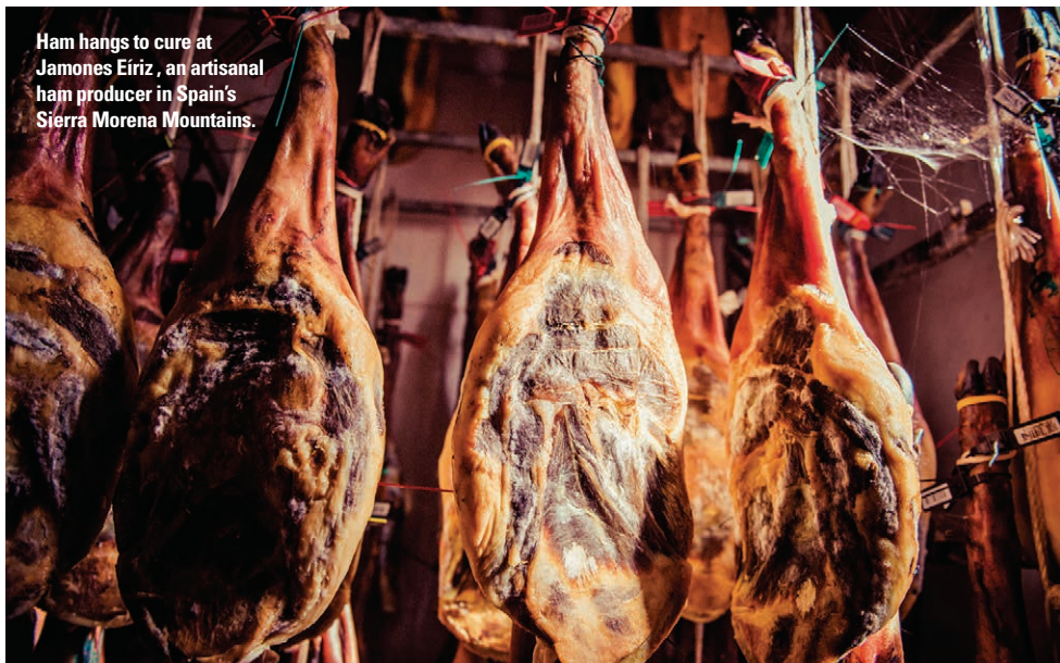
Ham hangs to cure at Jamones Eriz, an artisanal ham producer in Spain's Sierra Morena Mountains.

We arrived in the city of Evora yesterday, after a 130-km journey east, across the Tagus River and into Portugal's south-central Alentejo region. The five-star M'AR de AR Aqueduto, a modernized 500-year-old palace in the heart of Evora's preserved medieval district, is a juxtaposition of chic design and regal